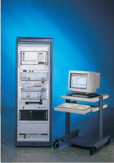
TS1210 DECT Type Approval Test System (CTR 10)

customized DECT Protocol Tester for type approval tests of fixed and portable parts (CTR 22)