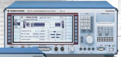
CMD 60, CMD 65

Digital Radiocommunication Testers for speedy and cost-effective measurements on DECT communication devices