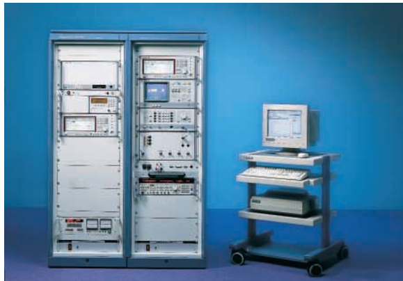
TS8930 DECT Type Approval Test System (CTR 06) TS 8930 is the worldwide standard for testing and developing the air interface of DECT devices

Digital Radio Testers for fast and conclusive DECT measurements regarding RF parameters, power ramp and BER