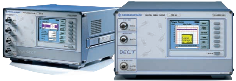
CTS 60, CTS 65

Digital Radiocommunication Testers for speedy and cost-effective measurements on DECT communication devices